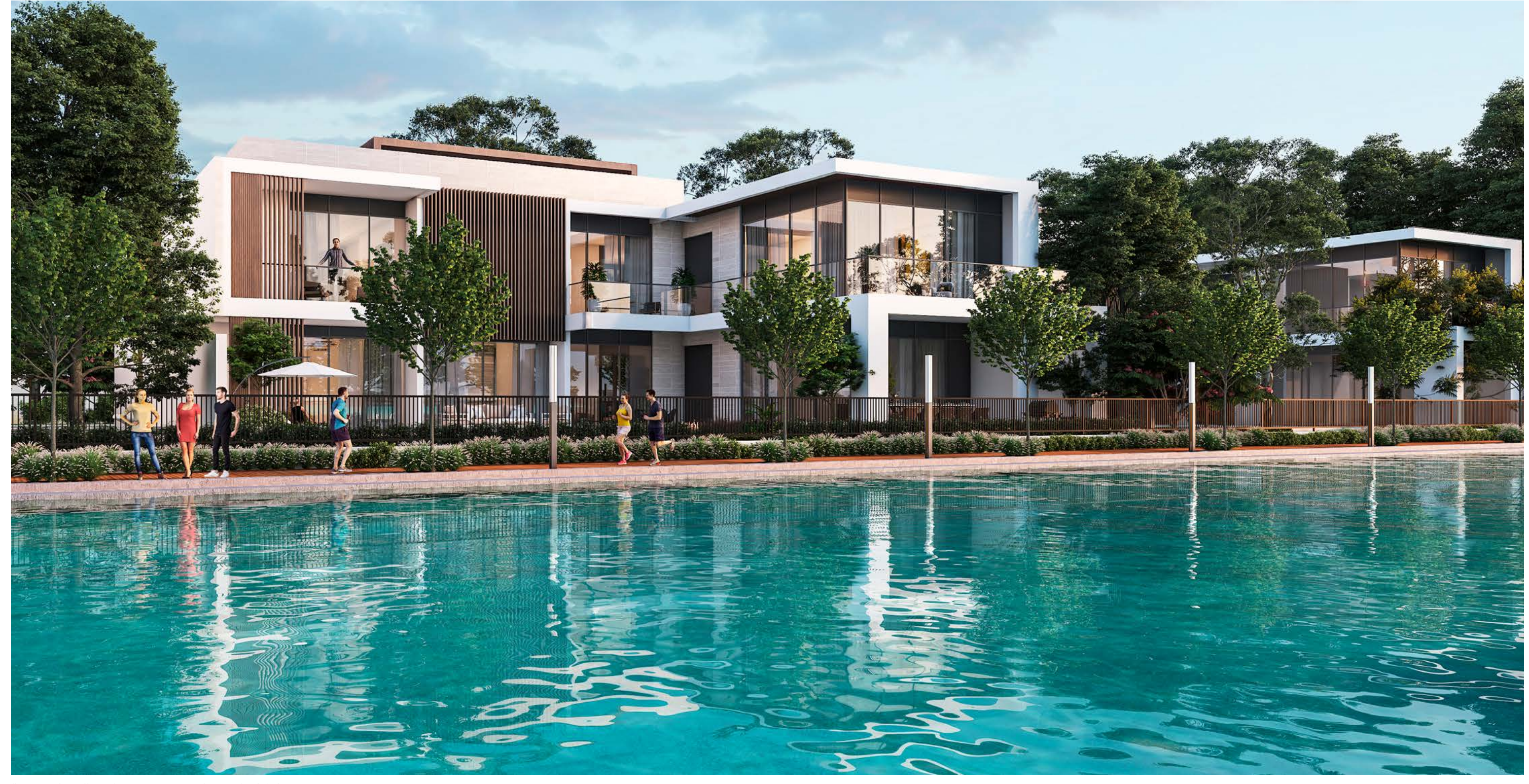
All images & renders used here are for representative purposes only, may vary from the final.

From the soft rustling of leaves to the soothing sound of water lapping against the beachfront, reconnect with nature and discover living at its finest.